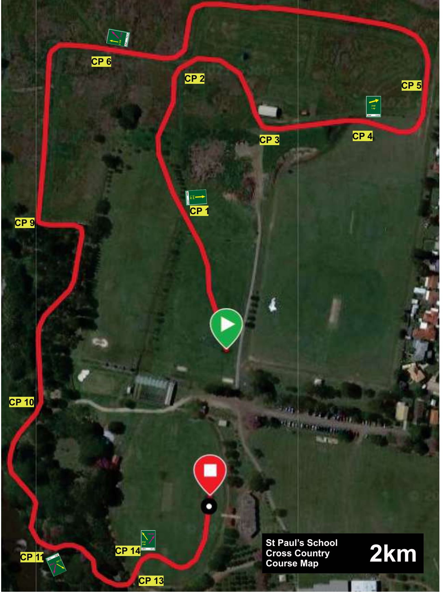
St Paul's School Cross Country Course Map